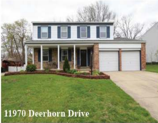
11970 Deerhorn Drive