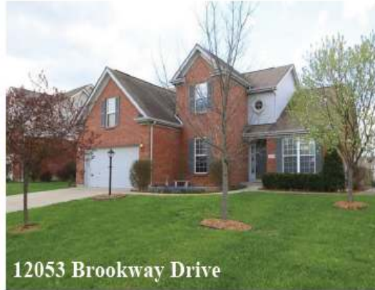
12053 Brookway Drive