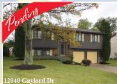
12040 Gaylord Dr

Fabulous and trendy home on cul-de-sac street! Updated kitchen and newer appliances. New baths with ceramic tile. Family room with woodburning fireplace and walkout to spacious deck (28x12). Lower-level recreation room, loads of storage, replacement windows. Over 1900 SF. A real gem! $159,900