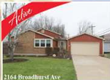
2164 Broadhurst Ave

Fabulous and trendy home on cul-de-sac street! Updated kitchen and newer appliances. New baths with ceramic tile. Family room with woodburning fireplace and walkout to spacious deck (28x12). Lower-level recreation room, loads of storage, replacement windows. Over 1900 SF. A real gem! $159,900