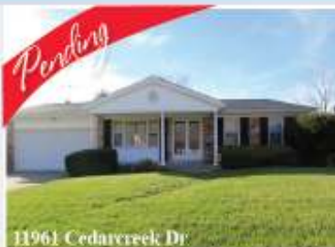
11961 Cedar creek Dr

Unbelievable! Everything's done! Updated kitchen and baths, windows, flooring, heat pump. Possible fourth bedroom. Fabulous master bedroom addition with adjacent bath with whirlpool tub and double vanity. Private deck off master. Family room with wet bar and walkout to patio/lovely yard. 2700+ SF per HCA! $164,900