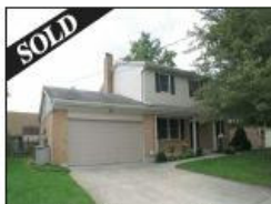
1769 Forester Drive