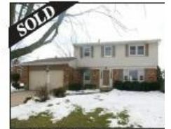
12017 Cedar creek Drive