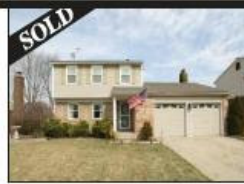
2142 Hillrose Court