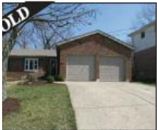
1904 Fullerton Drive