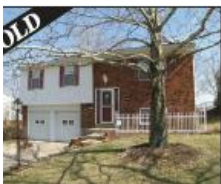
12074 Freestone Court