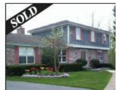
1909 Centerbook Court