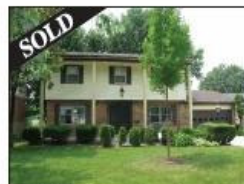
12165 Deerhorn Drive