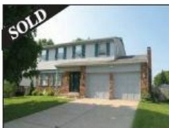
1931 Broadhurst Avenue