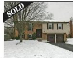
11969 Blackhawk Circle