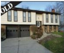
1395 Hazelgrove Drive