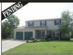
2107 Hillrose Court