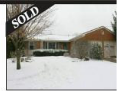
1755 Clayburn Circle