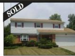
1808 Forester Drive