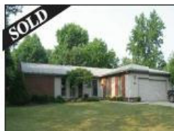
1905 Centerbook Court