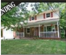
11997 Cedar creek Drive