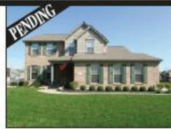
12152 Brookway Drive