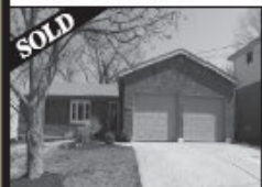
1904 Fullerton Drive

Pleasant Run Farms... look what's selling!