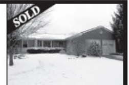
1755 Clayburn Circle