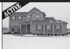
12152 Brookway Drive