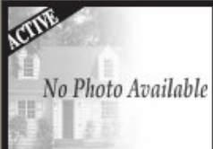
11918 Elmgrove Circle