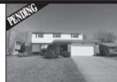
1808 Forester Drive