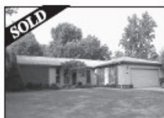
1905 Centerbook Court