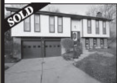
1395 Hazelgrove Drive