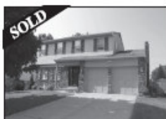
1931 Broadhurst Avenue