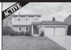
2142 Hillrose Court