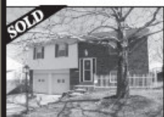
12074 Freestone Court