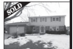
12017 Cedar creek Drive

Pleasant Run Farms... look what's selling!