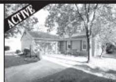
1928 Creswell Drive