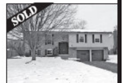
11969 Blackhawk Circle