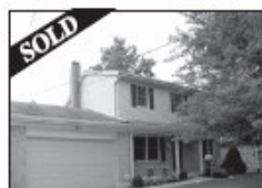
1769 Forester Drive