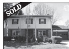
12165 Deerhorn Drive