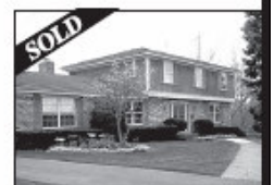
1909 Centerbook Court